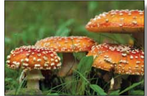
Amanita muscaria