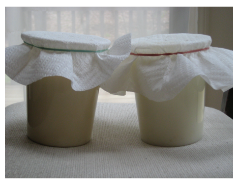
Step 2. Leave covered at room temperature for 24 hours.