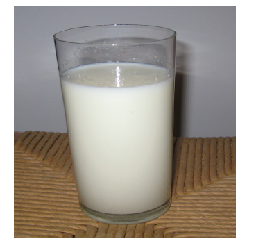
Step. 6. Chill for better flavor.