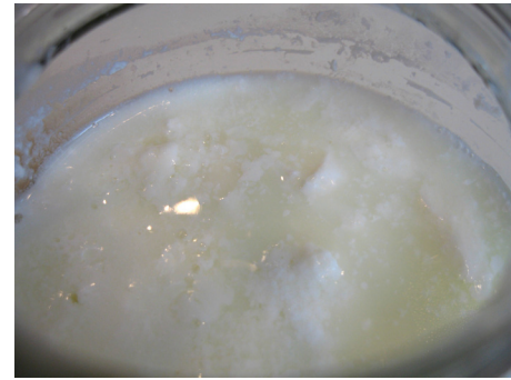
Step 5. Pour kefir beverage into a glass.