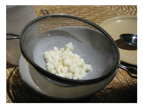
Step. 4. Place kefir grains into a container of fresh milk.