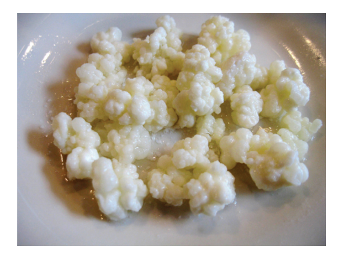
Step 1. Place fresh kefir grains in a container of fresh milk.