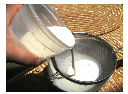
Step 3. Pour through a sieve to retain grains.