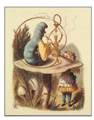
John Tenniel illustration for Lewis Carroll's Alice's Adventures in Wonderland , 1865.

The mushroom that appears in Lewis Carroll's Alice's Adven tures in Wonderland (1865) is arguably the best-known mushroom in the western literary tradition. The controversy and mystery surrounding Carroll's mycological knowledge is therefore proportionally large, and this is significant, given that the mushroom was the size of Alice herself. That is to say, it was the size of a mushroom, for Alice had shrunken considerably. In a fantasy world