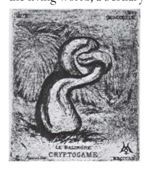
Charles Meryon – The Sickly Cryptogam (etching), 1860

The nineteenth-century French illustrator Charles Meryon (1821–1868) produced an etching in 1860 entitled "The Sickly Cryptogam." In it, a convoluted, mushroom-like growth seems to feed upon itself, as if it had coalesced by anastomosis into a topological enigma like a Klein bottle. Meryon's cryptogam would be a fitting emblem for Lautreamont's Les Chants de Maldoror, which posits an enigmatic world superabundant with menacing wildlife and seething with the bestial, the pestilential, and the unexplained. A literary beacon of the first magnitude for the surrealists, Lautreamont unleashed Les Chants de Maldoror upon the world in 1869, and it remains an uncanny counterpart to Charles Darwin's theory of evolution by natural selection, in which life forms appear in riotous profusion and endless metamorphosis. The natural history index to Lautreamont is formidable: there are approximately 70 botanical, 34 entomological, 60 ornithological, 106 zoological, 11 mycological, and 9 fabulous taxa represented in Les Chants de Maldoror, amid countless other general references to the living world, a bestiary that eclipses even that of Poe. What is