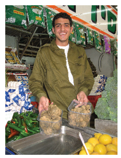
Desert truffles in the Tel-Aviv produce market.

ishable, four to five days after collection desert truffles develop a wonderful aroma and their own mild and nutty flavor when allowed to ripen gently. They are not eaten raw, and recipes for cooking them, some dating back to ancient Mesopotamia, abound. Traditionally, Bedouins roast the nearly golfball-sized truffles slowly in the dying embers of the evening fires. The Bedouins of the Negev eat the roasted truffles with samneh (fermented and clarified butter usually made with goat and sheep milk). In Saudi Arabia they make a delicious camel milk-and-desert-truffle soup.<sup>23</sup> In seasons of great abundance, the truffles are sliced and then dried or salted to preserve them for the fall and winter months, or to supplement the family's income by selling them at the market. Desert truffles have always been a favorite street food in souks around the Middle East where they are usually served scrambled