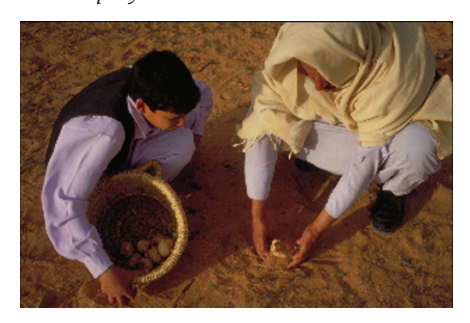
Digging for the desert truffle.

People who live on the boundaries of the desert tend to pay close attention to rainfall. The Bedouins believe that powerful winter thunderstorms, when bolts of lighting hit the ground