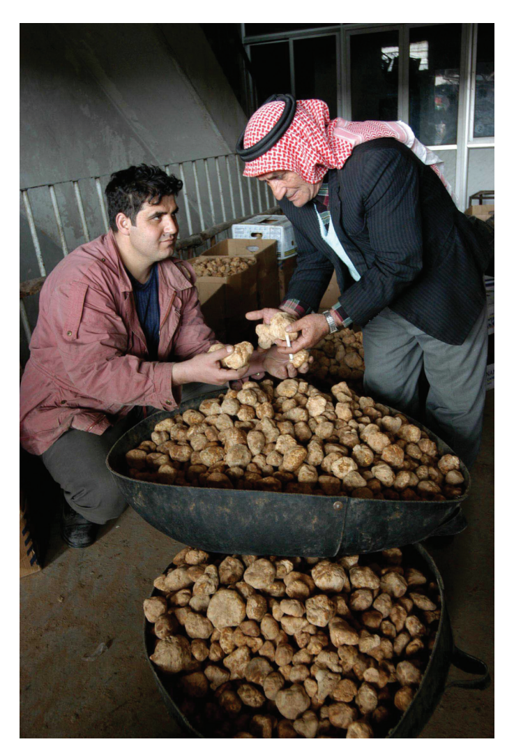
Desert truffles on sale at the Damascus market.

two thousand years ago, debated the origin of desert truffles and discussed ways to bless God for blessing people with them.<sup>A</sup> The Islamic Prophet Muhammad said to his followers that desert truffles were the "manna" that God gave the Israelites in their travels through the desert, and that their juice was a cure for eye ailments.<sup>7B</sup> Indeed, in 2004, an antibiotic compound was isolated